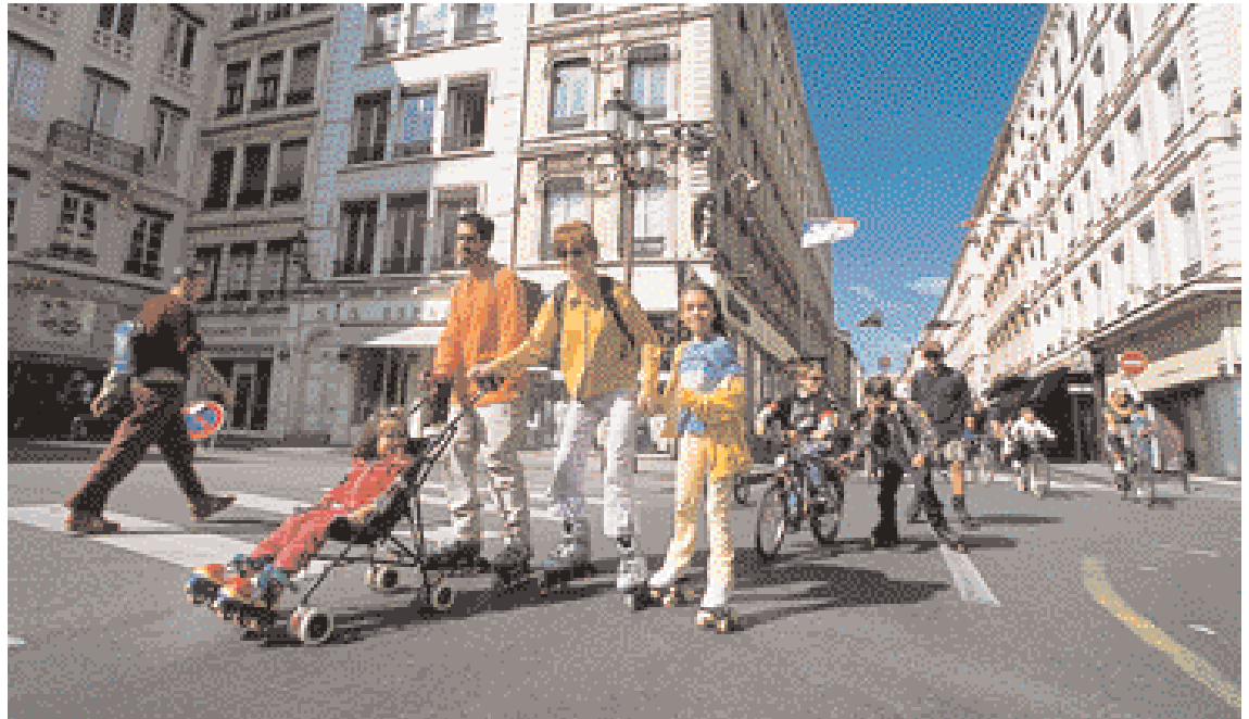
Place St Nizier

Once a month the society organises an evening get-together with a special theme.