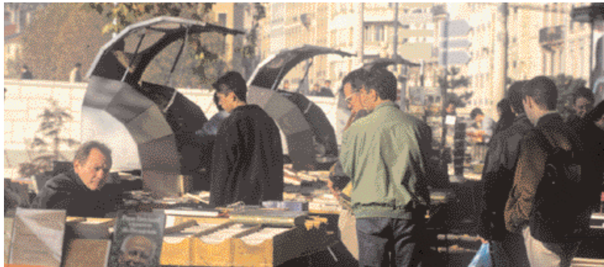
Bouquinistes, quai de Saône

The Chateau Online wine waiter introduces the wines of France, with information on grape types and vintages. He will help you choose the right wine for the dishes you serve.