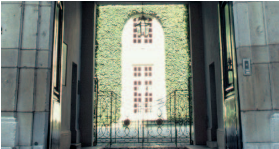
Musée des Tissus

You are strongly advised to apply for the long-stay visa when the purpose and dates of your stay warrant it.