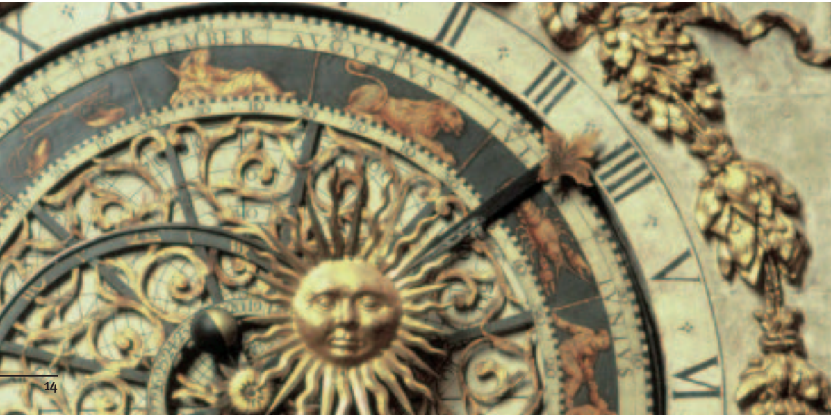
Horloge de St Jean