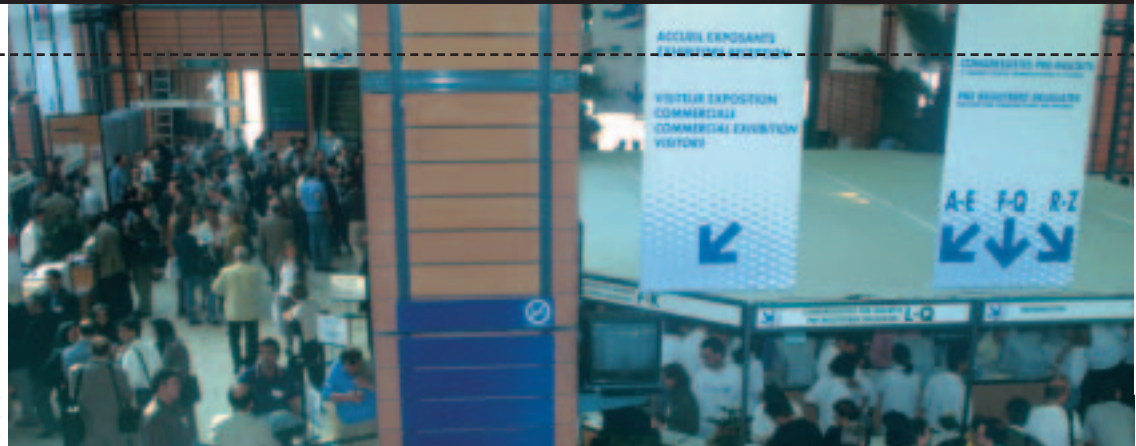
Palais des Congrès

Since the time of the European fairs during the Renaissance Lyon has been a city where people meet and exchange knowledge. Today its hosting capacity for international fairs and congresses is being steadily enhanced: Pollutec, Biovision and Lyon Mode City are only the three most recent examples of a success due to two local sites: the downtown Palais des Congrès convention centre and the Eurexpo exhibition complex.