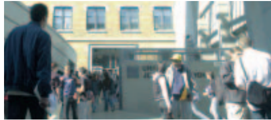
Université de Lyon

With over 110,000 students – 11% of them from abroad – and 6500 postgraduate degrees per year, Lyon is a leading light in French higher education. Lyon is, after Paris, the second largest university town in France: 4 universities (Lyon 1, Lyon 2, Lyon 3, Catholic University) and the prestigious elite academies: Ecoles Normales Supérieures (ENS Lyon and ENS Arts and Social Sciences), Ecole Centrale School of Engineering (ECL), National Institute of Applied Science (INSA), School of Advanced Studies in Chemistry, Physics and Electronics (ESCPE), Textile and Chemicals Institute (ITECH), EM Lyon (Management), National School of Veterinary Science, National School of Advanced Studies in Information Science and Librarianship (ENSSIB), and others.